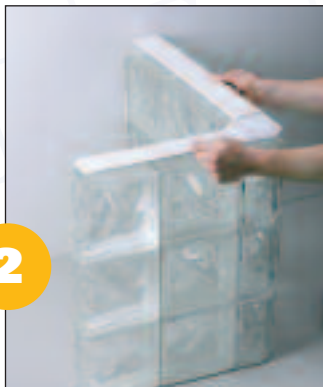
Place the horizontal, vertical and specialty shaped spacers on the silicone to align and keep each row of blocks perfectly in place.