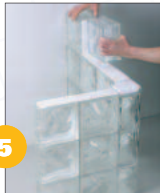
Repeat steps until your project is complete.