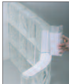
ProVantage™ Glass Block Installation System using ARQUE® Block

Installation instructions can be found in each package of ProVantage™ Vertical Spacers and on the Pittsburgh Corning website at www.pittsburghcorning.com .