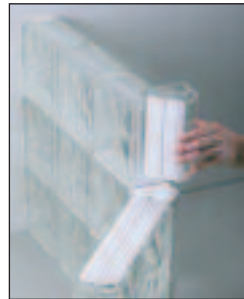
ProVantage™ Glass Block Installation System using TRIDRON® Block

Glass block panels that are built using the ProVantage™ Installation System and have four-sided support can be completed by finishing the joints with either silicone or surface grout. Glass block panels that have less than four-sided support should be completed by finishing the joints with surface grout only.