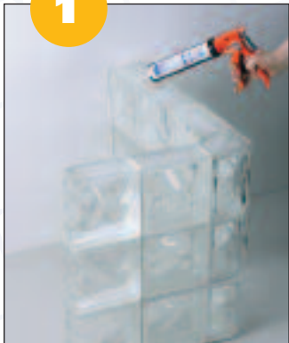
Bond the horizontal spacer to the glass block using silicone.